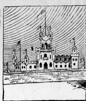
THE ICE PALACE.

You will want an overcoat, a $10 one will give you 20 chances to estimate the result of election day. See Paton's prize offer in today's issue. 10-8drft.