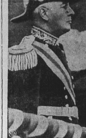
Sir Shenton Thomas, above, is governor and commander-in-chief of the Straits Settlements, British colonial area around menaced Singapore.