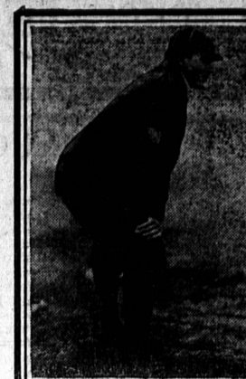
Clark Griffith, who guides the destinies of the New York Americans and spends his winters on his own ranch in the West. Griffith expects to have a winning team this season.

No matter what the outcome of the agitation in favor of the suppression of race-track gambling in New York—the state where the sport is given the greatest support by public and owners of thorough-breeds—there is a certainty that the season of 1908, which begins at Benning this month and then continues at New York early in April with the famous Carter Handicap, will have a notable crop of jockies.