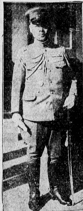
DIRECTS JAPANESE DRIVE