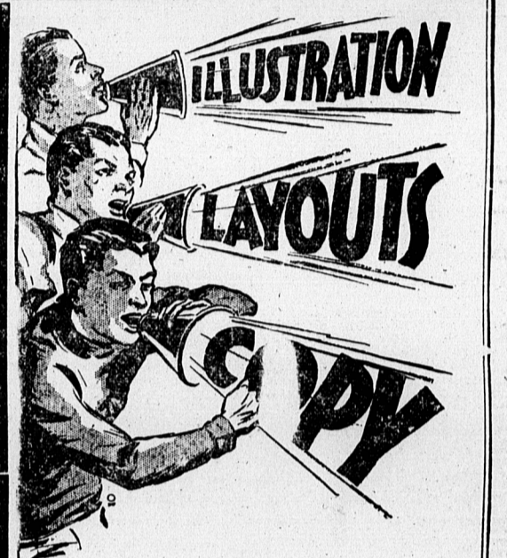
ILLUSTRATION LAYOUTS COPY

PHONE ROSS-DRUG-UNITED The Rexall STORE 219 SUCCESSOR TO THE MACKINNON DRUG CO.