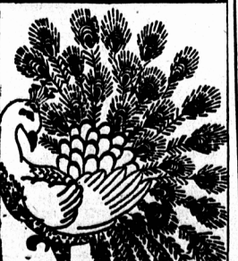
DESIGN NO. 727

This stately peacock furnishes a striking motif for the central theme of this bedspread. Hot iron transfer pattern contains motif 11 by 15 inches, sprays of feathers and complete instructions. Needlework Book 20 cents. To order: Send 20 cents in coin to Needlework Bureau, Charlotte town Guardian. Design No. 727