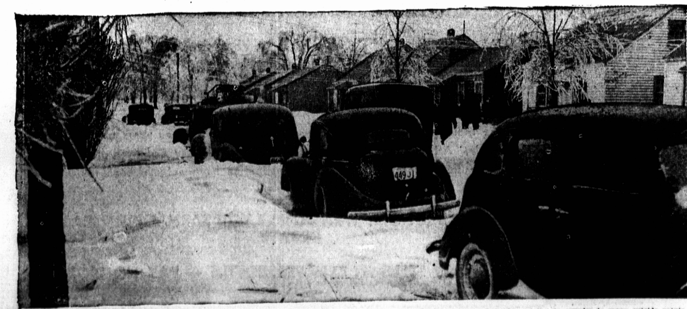
Freezing rain left these Hamilton, Ont., cars coated with a combination of snow and ice. Automobiles in foreground has icicles hanging from its running board. Schools were all closed for the day. Receiving the brunt of the storm, Hamilton saw 10 inches of snow fall in a little over 12 hours. A 30-mile-an-hour wind whipped it into big drifts to cause road blocks throughout the city. Telephone service to many outside points was interrupted for a while.