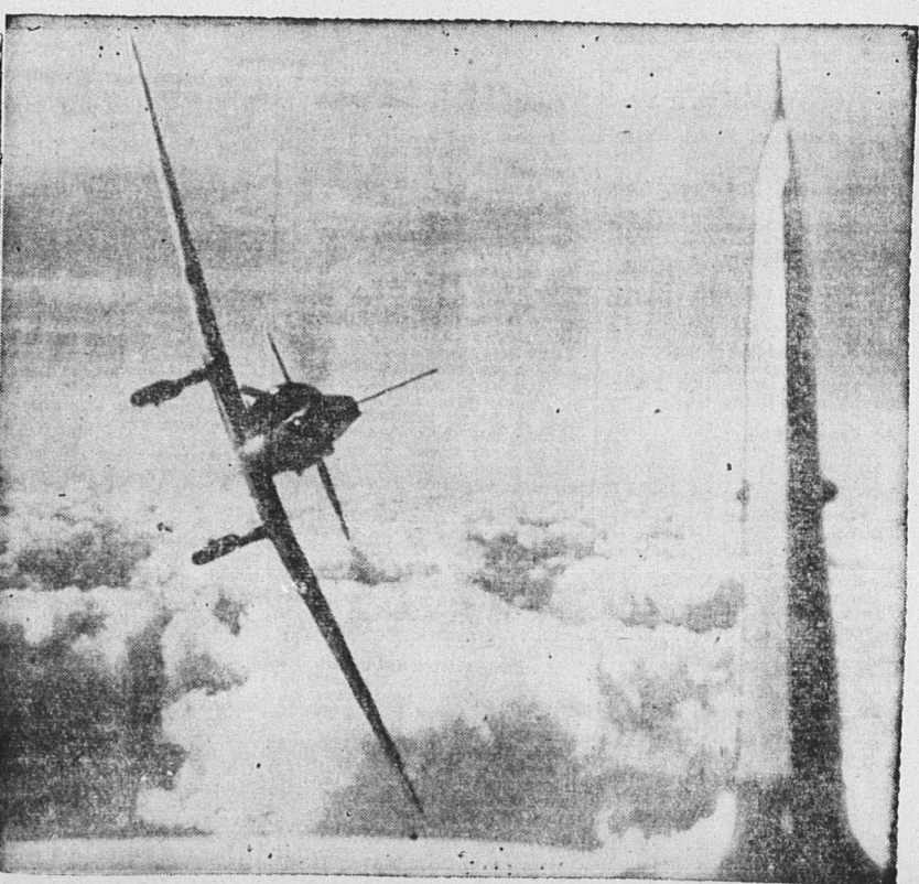
They call it a "flying knife blade"—and it's aimed at Hitler's heart should Nazi forces ever dare to challenge Randolph Field in Texas, as he and his fellow-students in the art of aerial war echo the roar of training planes from Canada's air fields.