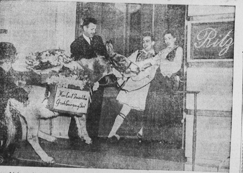
Pressed into service in New York to sell flowers in the old Greek manner this donkey balks at entering the Ritz-Carlton, which must point up a moral lesson of some kind. Society girls in native costume employed beasts to boost benefit for fighting Greeks.