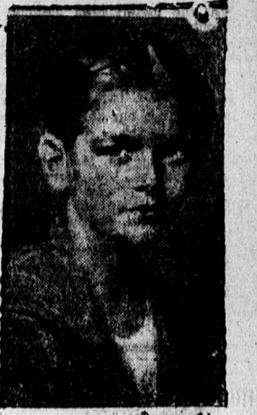
Thirteen-year-old Douglas Fairbank, Jr., has started in the movies at a salary of $1,000 a week, with opportunity of advancement. You may have seen Doug's father—he's in the movies, too.

TORONTO, June 25.—Maritime moderate northerly winds with little change in temperature. High tide this morning at 7.06 and tonight at 8.22. Sun sets this morning at 7.55 and rises tomorrow morning at 4.10. Full moon Thursday, June 28th. Summerside tide eighteen minutes later than Charlottetown.