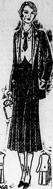
No. 2968. Size ..... Name ..... Street Address ..... City ..... State .....

This one is charming in a "guardman" blue and white thin woolen plaid. And incidentally plaids are tremendously chic. The upper part of the bodice, jacket facing and trim are in plain woolen in matching blue shade.