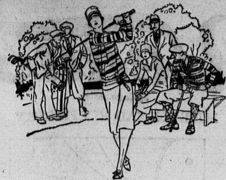
The "Foursome" in