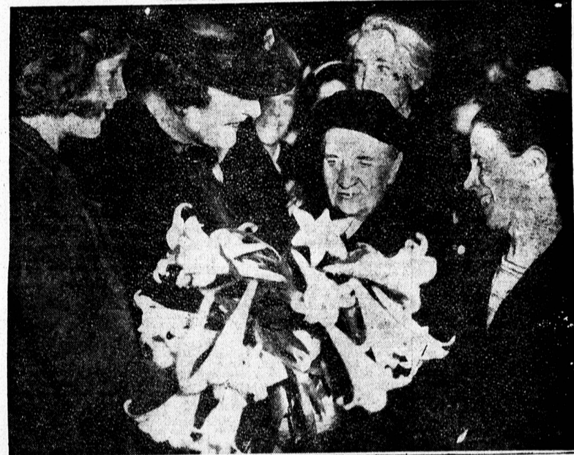
Through the combined influence of the British Foreign Office and Joseph Kennedy, American Ambassador to Great Britain, 28 nuns who have been evacuated from Barcelona on a British warship and will be given sanctuary in three convents in London. One of the number is shown in the centre, being greeted with a bouquet of flowers as she arrived in London.