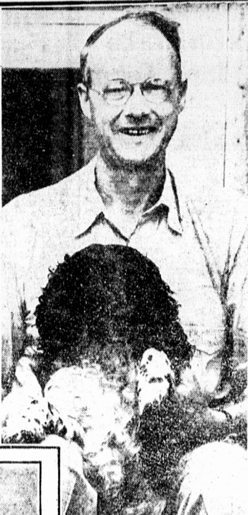
Premier T. D. Pattullo, of British Columbia, receives at the hands of Miss Phyllis Savage, queen of the Potlatch of Progress celebration at Seattle, a "Potlatch Bag." The potlatch is a civic festival attended by thousands of visitors.