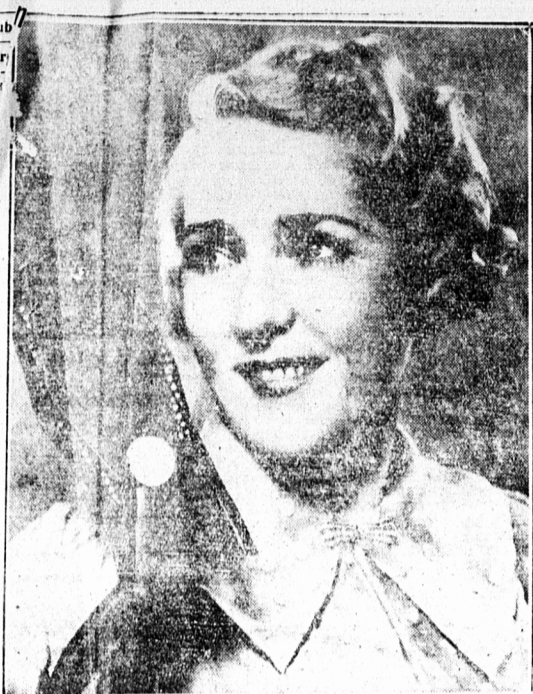
Toronto's Mary Pickford is coming home—and for the best of reasons. From Hollywood the famed actress said she will arrive at Toronto on Aug. 16 to appear on a charity broadcast in connection with a summer camp for poor children.