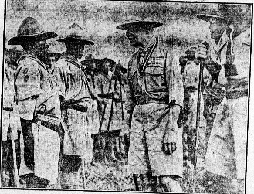
The Chief Scout of the world, Lord Baden-Powell, 83 years old on February 22nd, and still getting around amongst the boys of his world empire of youth. Above, chatting with some Scouts in Uganda.