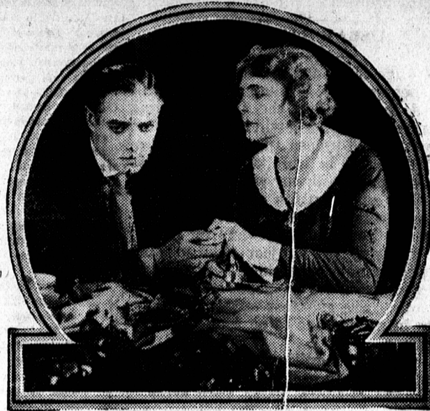
CECIL B. DE MILLE'S PRODUCTION "THE WHISPERING CHORUS" An ARTCRAFT Picture

An absorbingly dramatic and tense story of a man who, harassed by debt, resorts to theft. He deserts his wife, becomes a hermit; longshoreman, changes clothes with a drowned man, assumes an alias and later is hunted down by the police who mistake him for his own murderer.