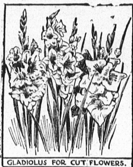
GLADIOLUS FOR CUT FLOWERS.

The primulinus varieties are not so large as others. They have slender stems, and the flowers are small, but they excel in daintiness and in exquisite coloring, especially in salmon shades. Some of the salmon pinks in which they abound are exquisite in the border, planted in small groups, with blue flowers as a foil. These