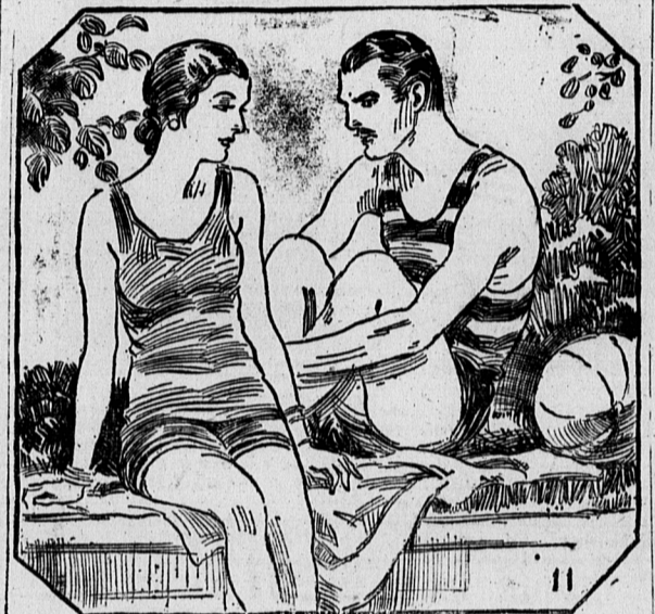
"Where's Millicent? Isn't she coming?"

butterfly is captured, the chase is dropped. But that is the end of the butterfly. So it was with Elinor's suitors.