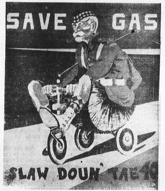
YOUNG ARTIST CONTRIBUTES TO CONSERVATION DRIVE