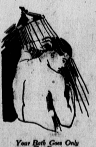
Your Bath Goes Only Skin Deep

It is but a step from those immediate results of constipation—headache, heaviness, loss of appetite—to serious disease. Such minor ailments are a warning that poisons from food waste are flooding your body. Keep clean internally.