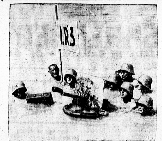
Something new in water sports that was not demonstrated at the Olympic Games, is shown here as it was introduced at Wien, Germany. A machine gun ditchment, literally wading in public manoeuvres, they could do.