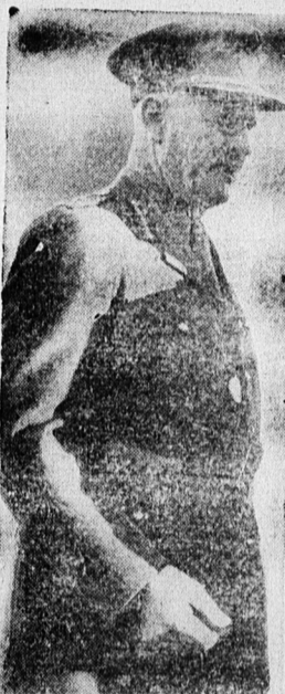
Gen. Douglas MacArthur, who is reported to have been in Manila, is shown in a photograph taken during the war.

WASHINGTON, Jan. 2.—(AP)—The Atlantic Ocean is now being patrolled by a fleet of German submarines, according to a report from the United States Navy.