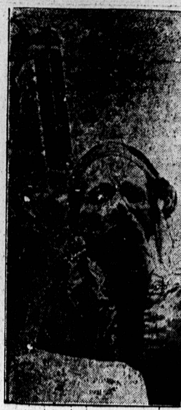
READY FOR THE FRAY

Inquiries for information and assistance in docking, castrating, etc. will be given attention. Address the Sheep and Swine Promoter, Dominion Live Stock Branch, Charlottetown.