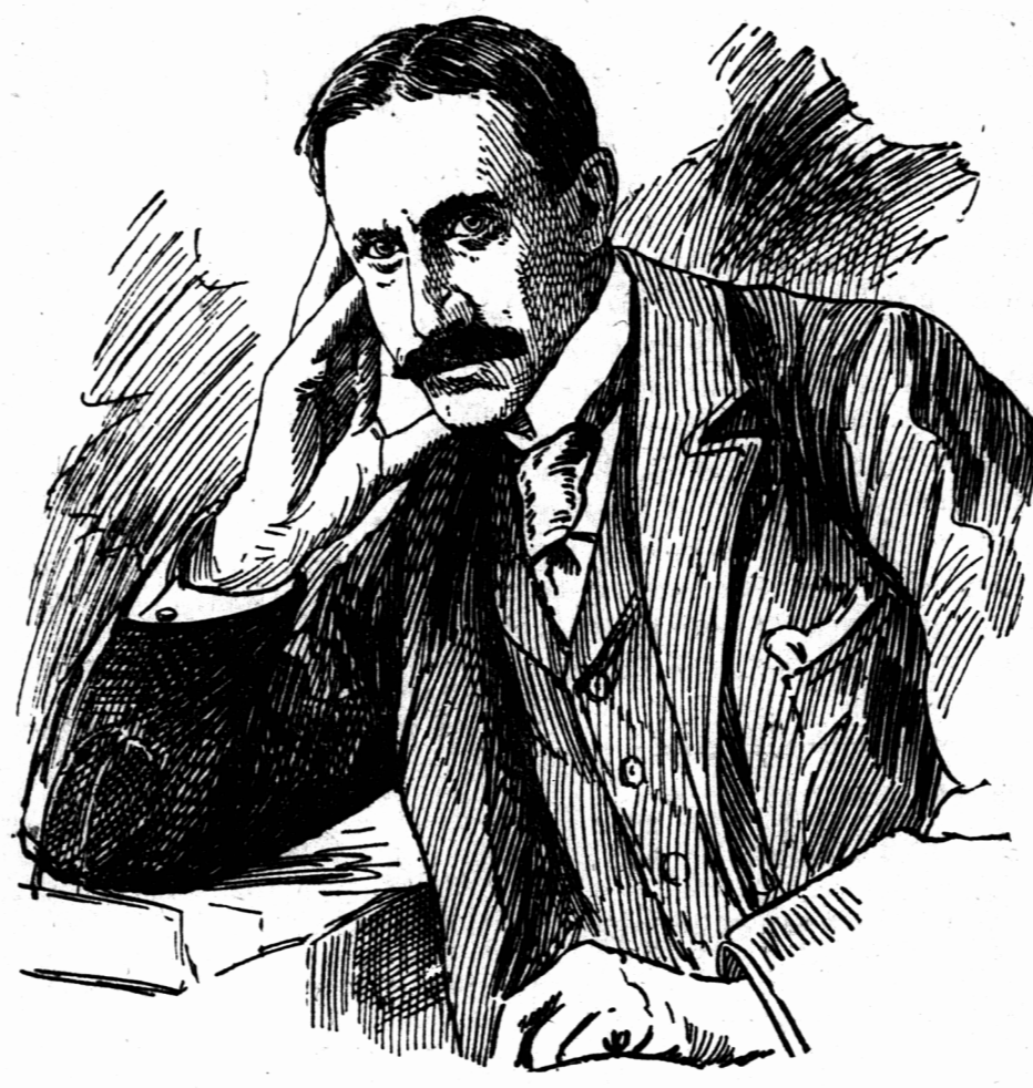
SIR ALFRED MILNER.