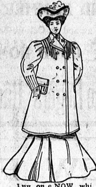
Buy one NOW while you've the opportunity, WORTH $8.90, TO-DAY..... $2.75

We've just a dozen coats to offer. Every one is a 1905 importation, correct as to fit—fashionable as to style. They're mostly medium lengths—splendidly finished, perfect fitting. Made of fine covert cloth—some of beaver. Fawns and greys only. Original selling prices $9.75 to $17.95. CHOOSE NOW AT $3.50