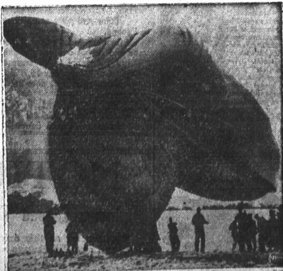
And now the peaceful Swiss, fearing violation of their traditional neutrality, are tightening up border defenses. Here a "barrage balloon" is being sent up from a snow-covered air-field near Basoch, part of a border defense plan against air raids modeled on that developed for London.