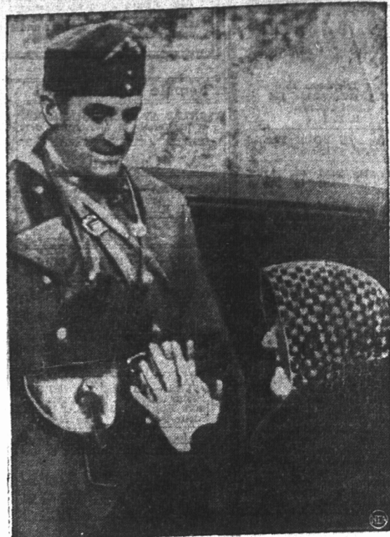
In a plea for the lives of her loved ones, a Ruthenian peasant woman implores a Hungarian general at Chust, Carpatho-Ukraine, to spare her sons, scheduled for execution for resisting Hungary's occupation of Ruthenia.