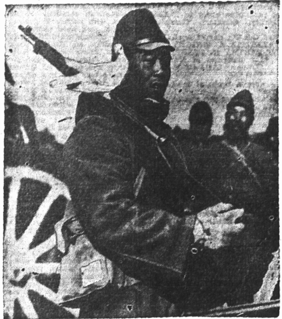
The bird perched in friendly fashion on the rifle of a Japanese soldier at Hanchow, China, may suggest the dove of peace, but actually it is a working member of the Nipponese invading forces—a carrier pigeon used for military messages.