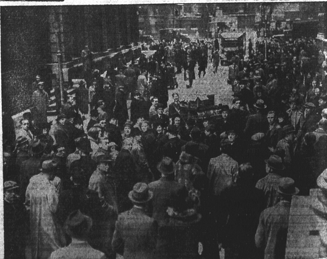
Londoners do get excited at times, and even gather in crowds at local points. Here is a scene in Little Downing street, London, where the British Prime Minister and the Chancellor of the Exchequer live. The picture was taken when Mr. Chamberlain was entertaining diplomatic and defense experts in advance of a statement in Parliament. And where a London crowd gathers there will always be found a vendor of drinks, etc., with his cart.