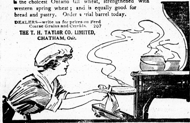
CANADA FOOD BOARD FLOUR MIL. L. LICENSE NO. 10.

DEALERS—write us for prices on Feed Coarse Grain and Cereals. 207 THE T. H. TAYLOR CO. LIMITED, CHATHAM, Ont.