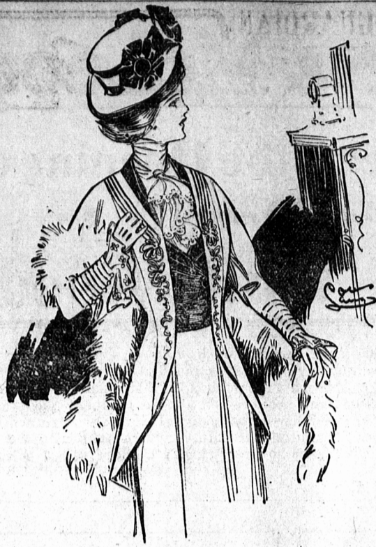
Bright blue cloth was used to make this suit. The skirt is plain, all decoration being on the coat which is braided with black and has a fancy vest of black satin closed with large flat black satin buttons. The hat is of blue felt trimmed with black velvet and a band of bright embroidery.