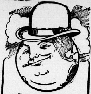
The Hat of the World The Stetson

Just as it appears on the surface, so it is right straight through. Its beautiful finish has back of it the highest quality of materials and skill of workmanship. It is always the standard of style in all countries; everywhere you go well-dressed men wear them. Every Stetson Bears the Stetson Name We carry the Stetson in all styles—Soft and Drab.