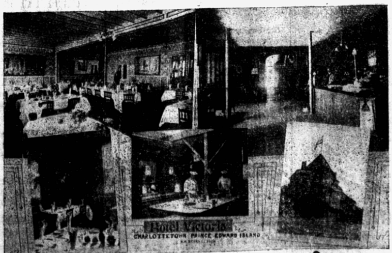
INTERIOR VIEWS OF THE "VICTORIA"