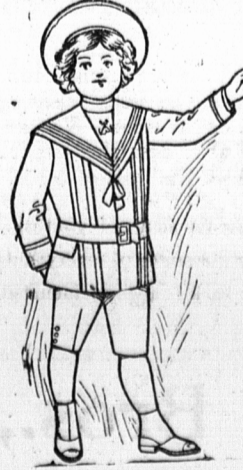
Sailor Suits, $1.50, $2.00, $2.50, $3.50 and $4.50