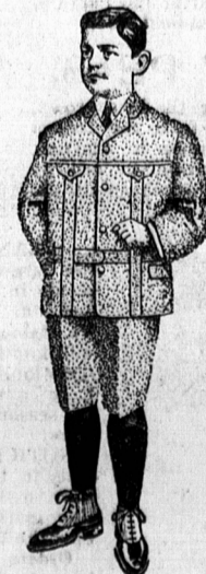
School Suits, $2.50, $3.50 and $4.00, Norfolks.