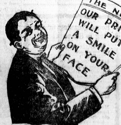
PATON & Co's.