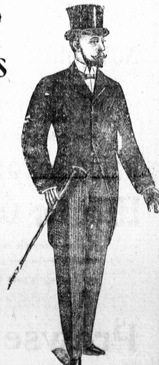
Dress Worsteds Suits, $10, $12, and $14