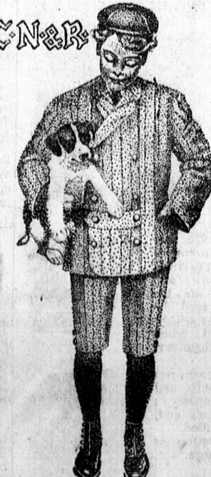
$4.50, $5.00 and $6.50, Like Above Style.