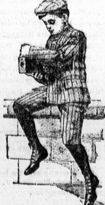
School Suits, $1.50, $2.00, $2.50 in Halifax