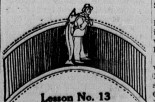
Lesson No. 13