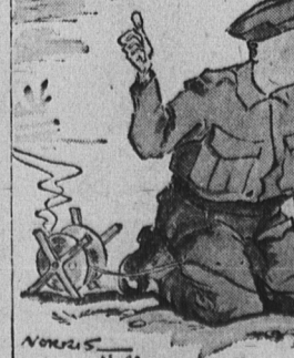
"That recruit from out West is awful stubborn."