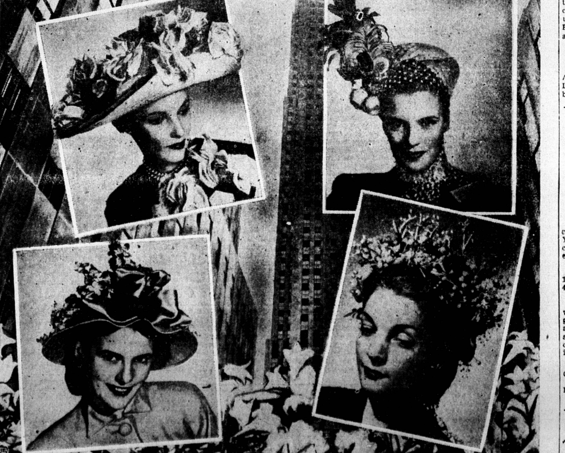
Framed in a background for a big city Easter promenade, here are four hats that typify what top-notch designers have dreamed up to make mildly lock her loveliest for 1947's Spring. Sally Victor's mauve pink ball bunnet straw (lower left) has pink shaded blossoms and pink satin ribbon bows to accent its rippling brim. John Frederic's romantic creation (upper left) is of pale natural leghorn sprinkled with gold sequins, topped with masses of white net and full-blown pink roses. Lilly Enche designed the pink-velvet turquoise straw toque (upper right), with pink rusebuds tucked at the base of four high-rising quills. Walter Florel's green milan pill-box (lower right) is ringed with a halo of yellow mimosa.

Back in post-war profusion, imported millinery materials have been added to the American output to make the Easter bonnet a dream of pale straw, luxurious trimmings. Rayon mist coaxed into