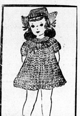
DESIGN NO. E-1117

An adorable dress and dutch bonnet for a little girl 2, 4 or 6 years old, is crocheted in a lovely shell stitch. Pattern No. E-1117 contains complete instructions.