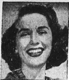
"Jinx" Falkenburg, famous New York photographic model.