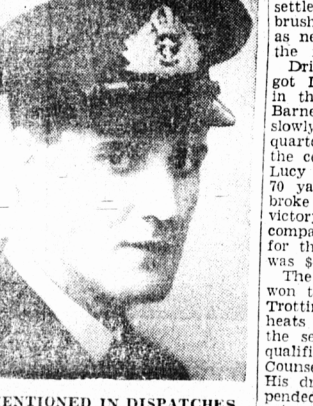
MENTIONED IN DISPATCHES

Authoritative British sources announced that Germany's attempts to gain power over and under the sea have been totally ineffective against large-scale troop movements between parts of the Empire since the threat of the war. The same statement applied to Italian naval and sea power in the Mediterranean these sources said. Not a ship was sunk, nor a life lost through "enemy action" in any of the great movements of men on giant liners and smaller craft in the deploying of the Empire's manpower, they said.