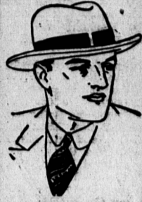
New Spring Styles. Exclusive colorings at most good shops

There is only one hat which will satisfy you for