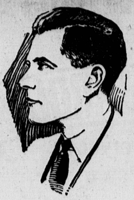
BERT LYTELL in the Paramount Picture "Kick In" A George Fitzmaurice Production

70 Miles by Air For Fifty Cents (By Dominion News Service) LONDON, July 12.—The Wren, tiny monoplane fitted with a 3-horse power engine, reached a speed of 53 miles an hour during Air Ministry tests at Lytham, Lancs., yesterday. It climbed to 2,350 feet—an altitude record for this class of machine. Although in the air for 80 minutes, less than a gallon of petrol was consumed. The machine was built for the Air Ministry. A new era in the air—that of cheap, safe, popular flying—is what is foreshadowed by the wonderful successes attained by such tiny motor-driven, or low-powered "air-cars," as the Wren.