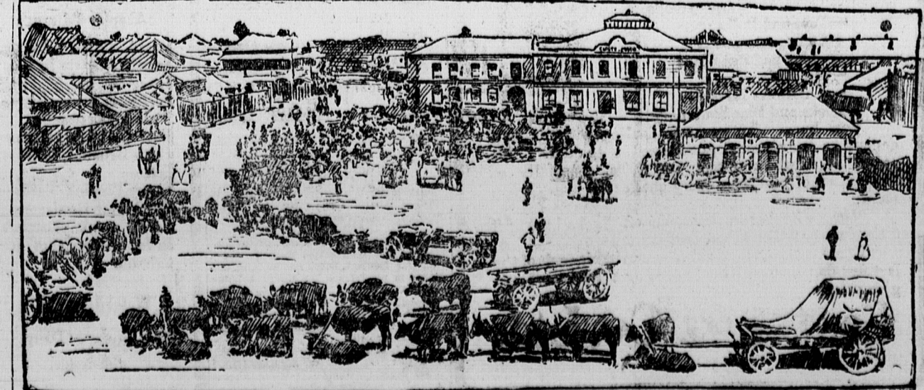
THE TRANSVAAL WAR-KIMBERLEY. THE DIAMOND TOWN.