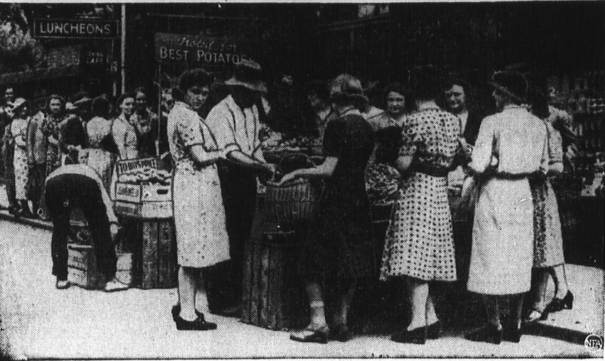
To buy potatoes, these Surrey housewives patiently stood in line—for the first time since the present war started.

Resenting Ration Abuse, Housewives Wage "Battle of the Larder"