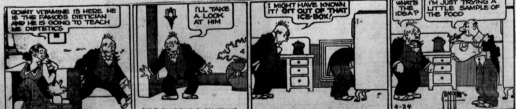
© 1935 King Features Syndicate, Inc., Great Britain rights reserved.