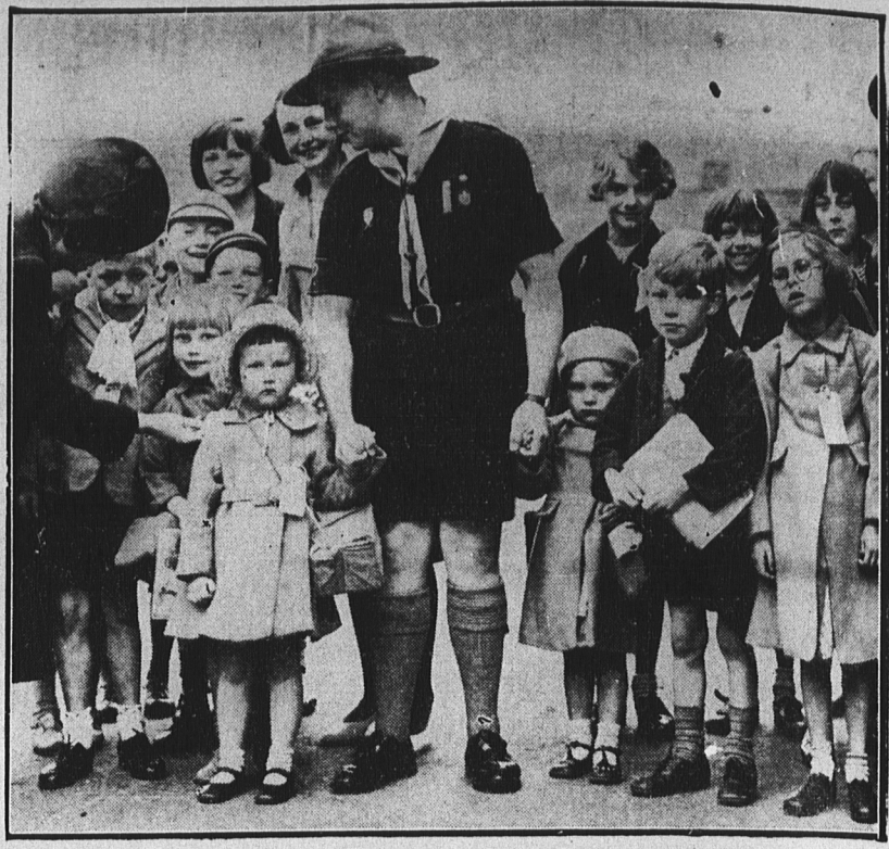
An English Boy Scout and his small evacuee charges. The lads assisted in the handling of many thousands of children removed from London and other cities.

But she dodged from bush to bush, and came to the top of the hill, to see him swinging along half a mile ahead on the track, which followed the side of a long spur covered with beech and manuka.