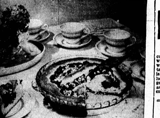
Cranberry Cake, as pictured above make a delicious dessert, festive in appearance yet economical and easy to make.

Topping 3-4 cup sweetened cranberry sauce 1-4 teaspoon cinnamon. 1 teaspoon grated lemon rind 1-2 teaspoon nutmeg Mix lemon rind, cinnamon and nutmeg with cranberry sauce Cake 3 tablespoons mild-flavoured fat 1 1-3 cups sifted, all-purpose flour 1 egg, unbeaten 2 teaspoon baking powder. 1 teaspoon vanilla 1-2 cup milk 1-2 cup sugar Cream fat and sugar until light and fluffy; add the egg and vanilla and beat thoroughly. Mix and sift flour, baking powder and salt and add alternately with the milk, beating well. Pour the batter into a deep, well greased, 9 inch pie plate or an 8 x 8 inch cake pan. Spread cranberry topping over the batter. Bake in a moderate oven, 350 degrees F. for 45 minutes. Serves six.