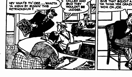
TILLIE THE TOILER By Webster