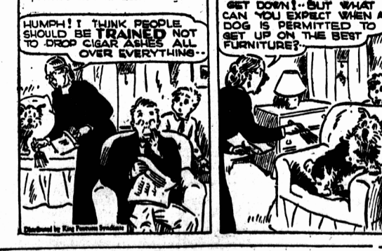
BRINGING UP FATHER By George McManus