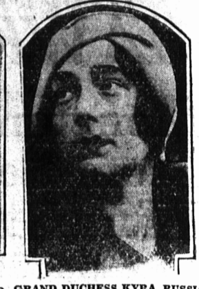
GRAND DUCHESS KYRA, RUSSIA, FRIEND, AGED 25

In this layout are shown the eight bridesmaids who will attend Princess Marina on the occasion of her marriage to Prince George on November 29. Of the eight, five are princesses, three of whom are cousins and one her sister. Princess Elizabeth and Lady Mary Cambridge, two youngest bridesmaids will probably act as train-bearers. Gown worn with delicate silver thread to make a perfect background for the bridesmaids.