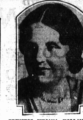
PRINCESS JULIANA, HOLLAND, FRIEND, AGED 25