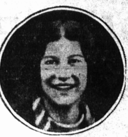
PRINCESS KATHERINE, GREECE, AGED 21