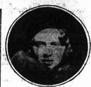
PRINCESS EUGENIE, GREECE, AGED 24