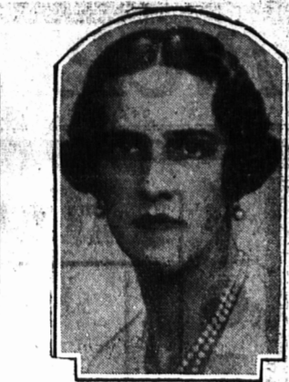
PRINCESS IRENE, GREECE, AGED 30