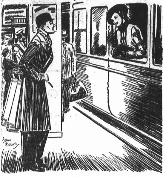
"Don't you want some fiction to read on your holiday?" "Why, you're going to write to me, aren't you?" -London Opinion.

Advertising Rates - Payable in Advance Minimum Charge for Any Advertisement 25 Cents. Central Guardian locals, 5c per word; Western and Eastern locals 2c per word; Announcements and Coming Events 3c per word; Classified 3c per word; In Memoriam Notices 70c per inch; Lists of Floral and Spiritual Offerings, Cards etc., 5c per name; Letters of Condolence 70c per inch. Wedding engagements 40 words for $1.00 and 10 cents for every additional 3 words. Notices of Thanks and Appreciation, 70c per inch or 40 per word. Lists of Subscriptions 45 cents per inch. Address and Presentation $1.00. Other rates on application.