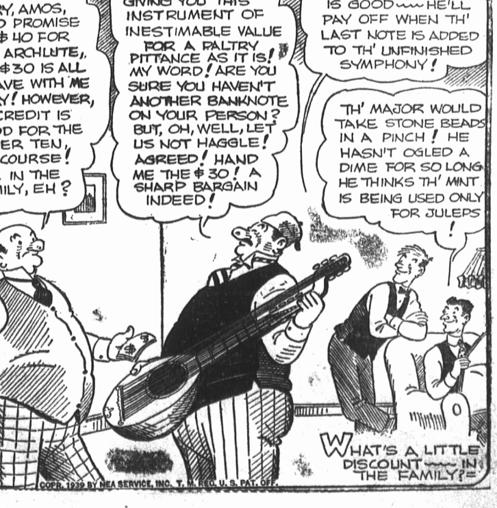
WHAT'S A LITTLE DISCOUNT IN THE FAMILY?