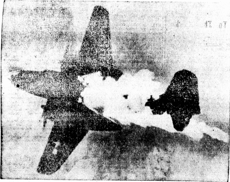
Returning from a pre-invasion mission over occupied France, an A-20 Havoc of the 9th Air Force hit by enemy flak bursts into flames. A few seconds after this photo was taken the plane went into a spin and plunged earthward.