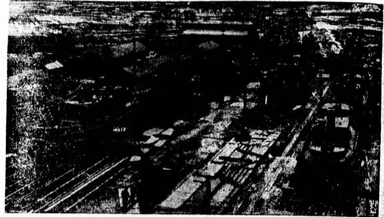
Last year, 45 steel invasion tugs slid down the ways at Trenton, Ontario, to swell the total of equipment tugs that are turned out by Canadian ship-builders for the British for invasion. This year twice as many of these tugs, be turned out by Canadian ship-builders for the British for invasion. This year twice as many of these tugs, be turned out by Canadian ship-builders for the British for invasion.