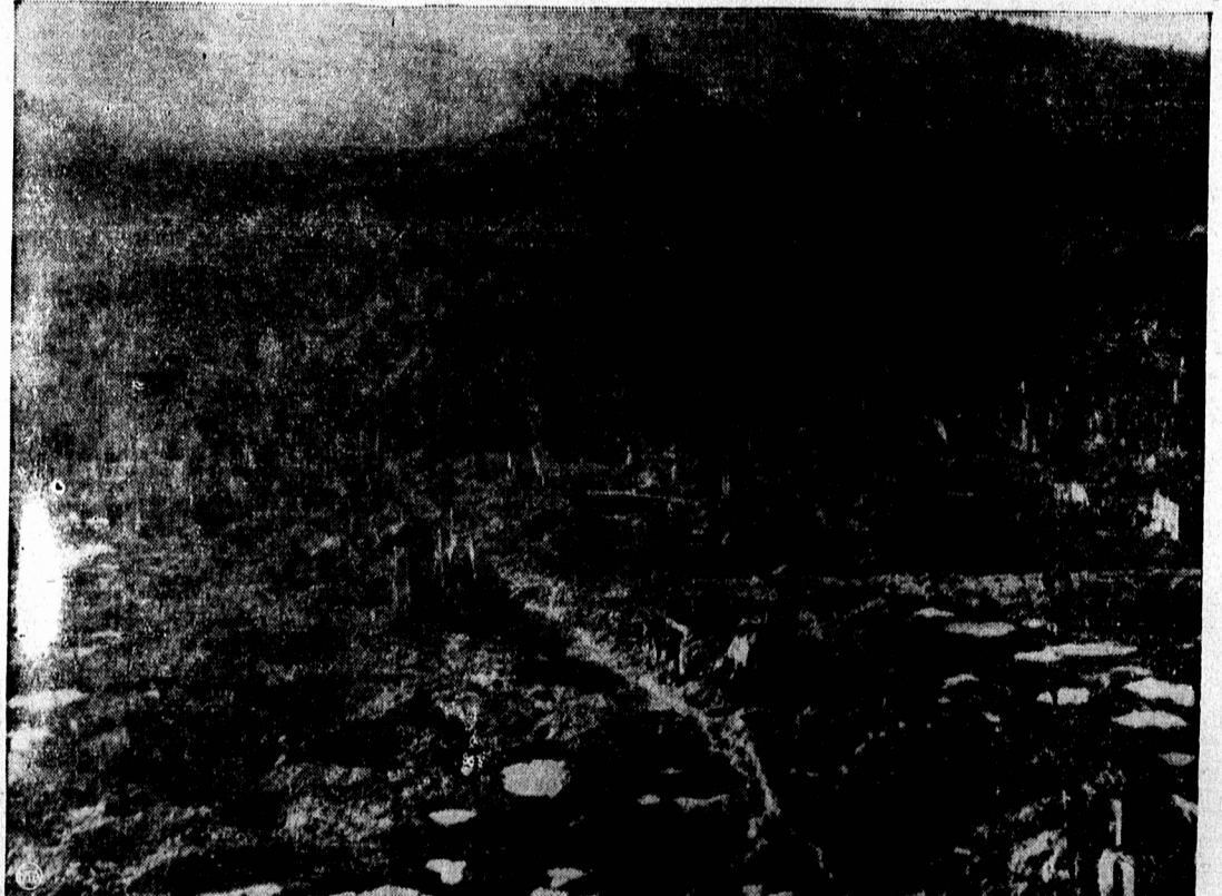
Jagged ruins rise like ghosts from the rubble heap that was once the beautiful Italian town of Cassino, which has now been declared officially dead. A fortified Nazi stronghold that signified the Allies for months, it was subjected to the worst artillery and air bombardment in history. This air view, showing the area around Cassino, was taken from a Fifth Army Artillery Observation plane.