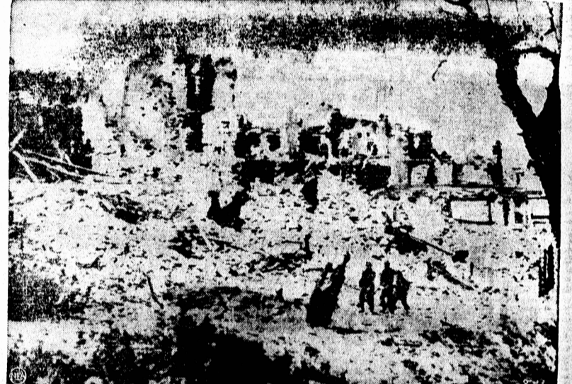
A trio of American soldiers plod their way through a debris-filled street of the once beautiful Italian town of San Maria Infante, which was ravaged by the Nazis from their stronghold here, as the Allies renewed their offensive. Withering artillery all along the Italian front.