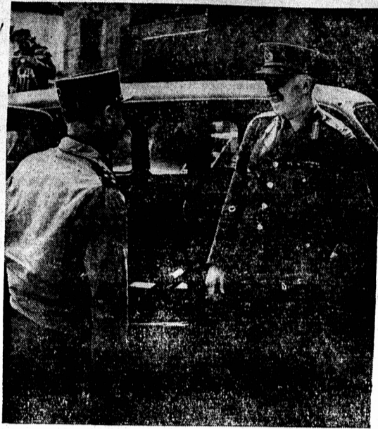
Major General G. P. Vanier, D.S.O., M.C., Canadian Minister to the French Committee of National Liberation, is shown here being greeted by General Juin, 1943, Commander of the Corps Expeditionnaire Francaise upon the occasion of Major General Vanier's recent visit to the Fighting French front line troops in Italy.