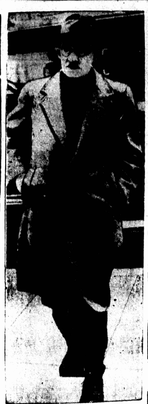
LIBEL, SAYS LASKI