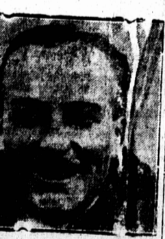
Alan Cobham, who left England June 30 to fly to Australia and back by seaplane, reached Port Darwin, South America, Thursday. He flew from the Dutch East Indies in the final hop.

Since 1910 the province of Saskatchewan has erected 5,151 miles of telephone pole lines, has opened 281 new exchanges, and 364 toll lines. There is a telephone installation for every eight of the population.