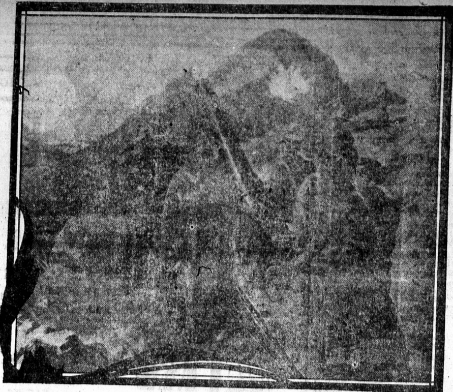
JAPANESE GUNS FIRING OVER HILLS INTO PORT ARTHUR.

Cure the Kidneys with Dodd's Kidney Pills and nine-tenths of the suffering human family has to endure will disappear.