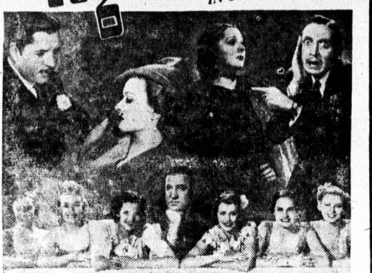
Helen VINSON - Mische AUER - Alan MOWBRAY - PLUS NEWS The Famous WALTER WANGER MODELS "The Most Photographed Girls in the World"

WARNER JOAN BAXTER BENNETT Walter Wanger's VOGUES of 1938 IN TECHNICOLOR