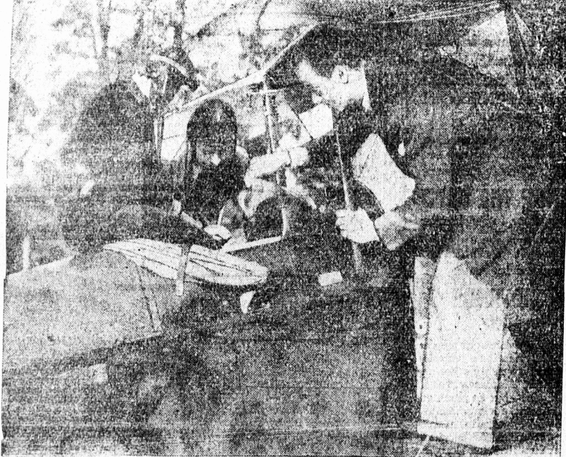
The first school for members of Britain's Civil Air Guard, for civilians willing to use their flying knowledge in the service of the nation in wartime has been opened at Hanworth. Here two student fliers are being told what the various instruments are for, in their first lesson. More than 1,500 students have been enrolled, and 115 have been chosen in the first group to be trained.