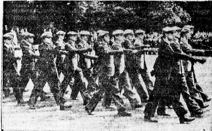
Dressed in "civvies," Gentleman Cadets who have been at Sandhurst only a week are shown on parade. The occasion was the annual rally of the southern area of the British Legion, when 5,000 members of the Legion paraded with the Sandhurst men.