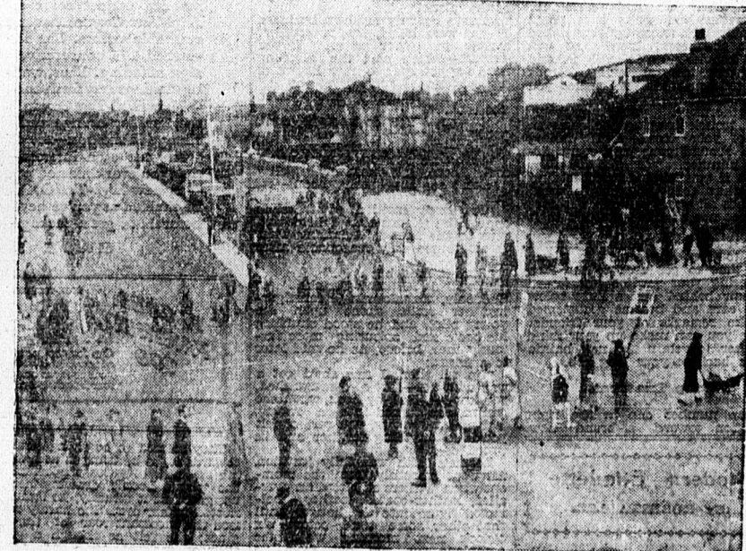
Traffic over the new footbridge at the Ferry Road Junction, London, waited while residents of Western Avenue, Acton, held a demonstration in support of their campaign for greater safety measures on the road. The parade, shown in this photo, took place shortly before the opening of the bridge.