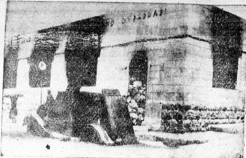
Hebron was one of the hottest spots in recent days in the Arab campaign of terrorism in Palestine. Here is the work of marauding Arabs in the city Barclays Bank was looted of cash, stamps and small bags and burned, and an armored car in front of it destroyed.