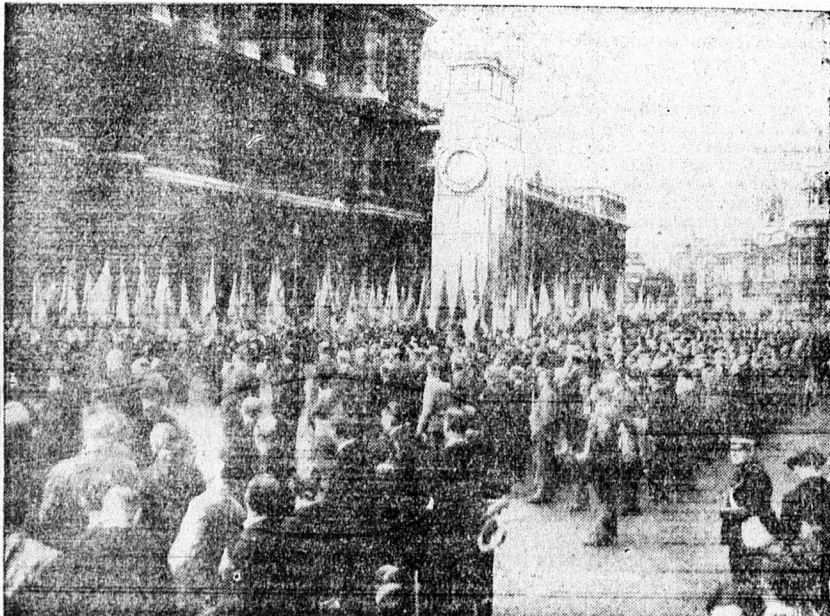
Members of the Old Contemptibles Association held a national parade and memorial service on the Horse Guards Parade in Whitehall, London, and then made their annual pilgrimage to the Cenotaph. The photo gives a general view of the march past the Empire shrine.